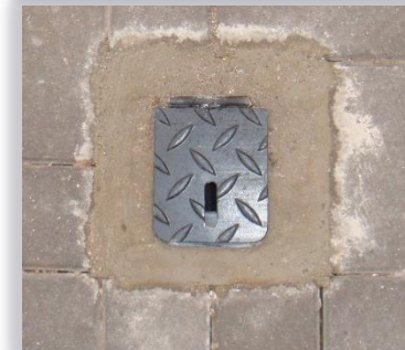
Base sits flush when not in use