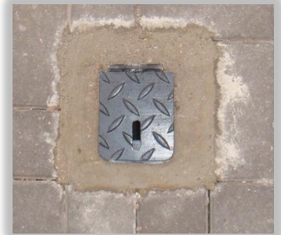
Base sits flush when not in use